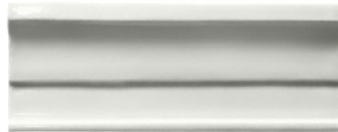
rail molding (s.o.)* 2 1/4"x6"