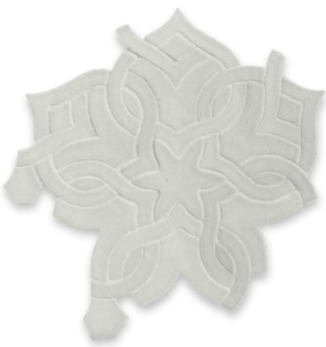
flora mosaic (s.o.)* 8"x8" 0.56 sqft/pcs face taped alba template