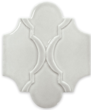
arabesquette (s.o.)* 6 1/8"x7 3/8" 0.22 sqft/pcs