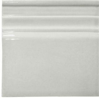
base molding (s.o.)* 6"x6"