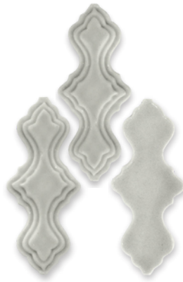
falbala (s.o.)* 2"x6" (1 pc) 0.17 sqft/pcs (sold as a 3 pc set)