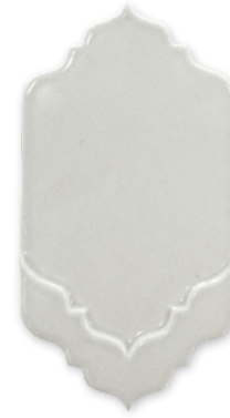
musa (s.o.)* 4 1/8"x8" 0.18 sqft/pcs