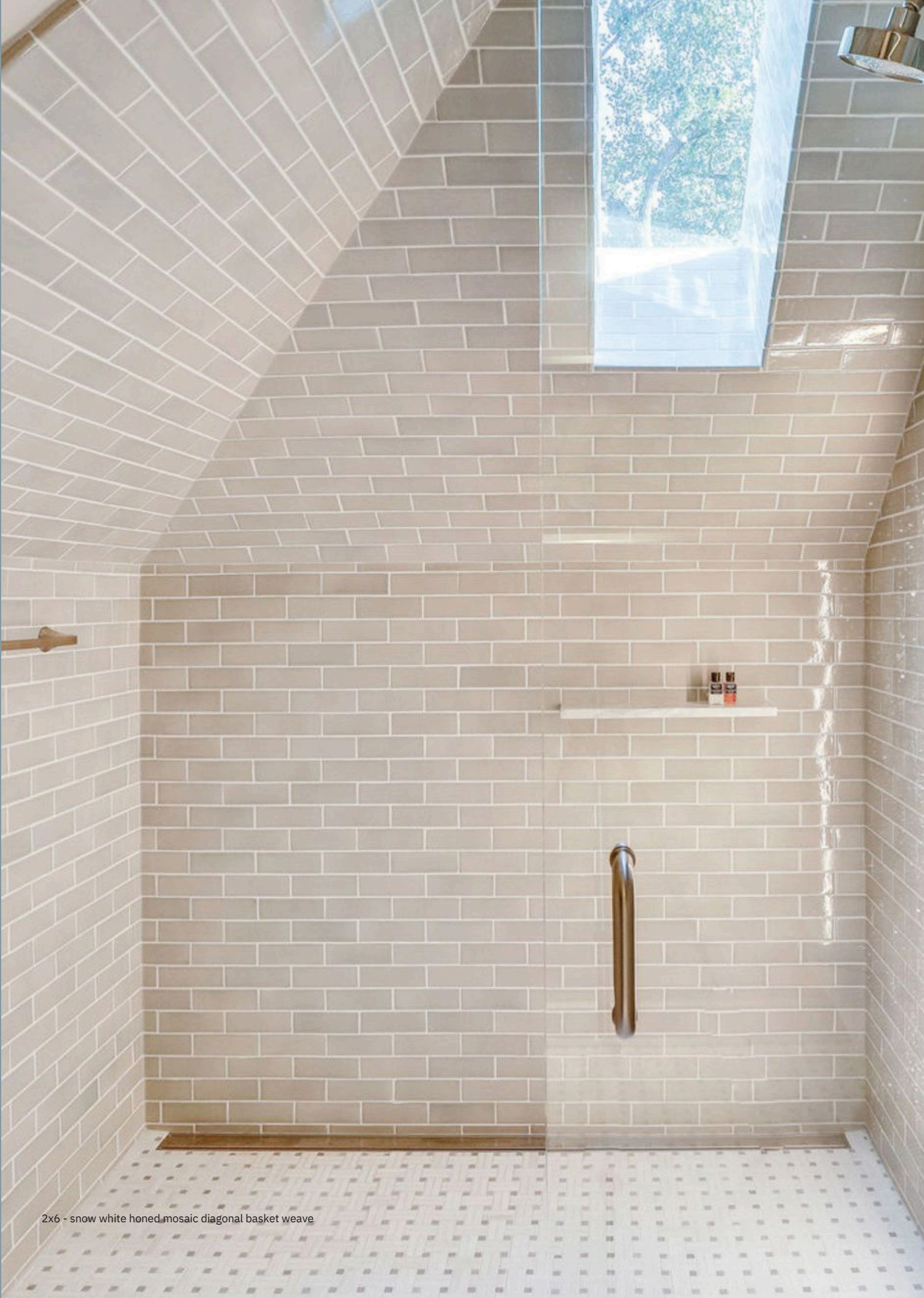
2x6 - snow white honed mosaic diagonal basket weave