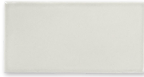
3"x6" field tile (s.o.)* 0.13 sqft/pcs