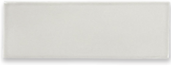
2"x6" field tile (s.o.)* 0.08 sqft/pcs