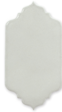
marbella (s.o.)* 4 1/8"x8" 0.18 sqft/pcs