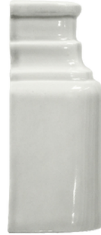
base corner (s.o.)* 2"x6"