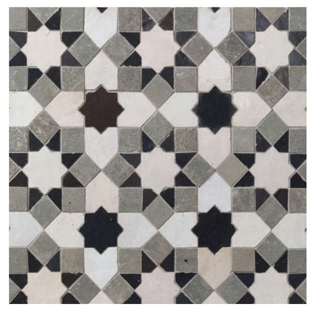
Blanc Gris MEL-TANGIER-BLANCGR