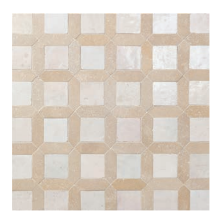
Palermo Mosaic 1" x 4", 2" x 2" Latte