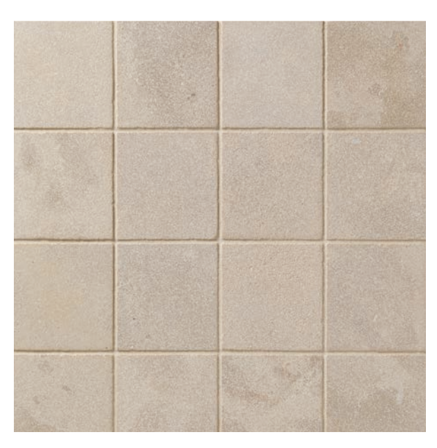
Luberon Limestone MEL-4X4FLD-LUBERON