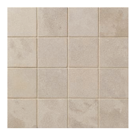
4" x 4" Field Luberon Limestone