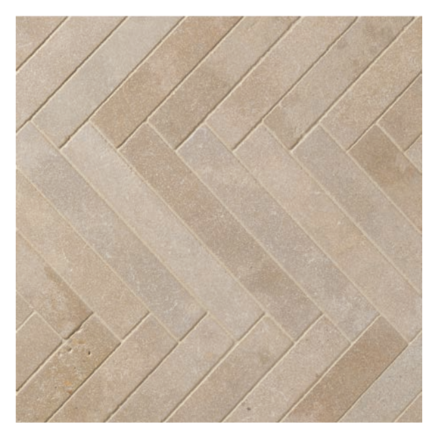
Luberon Limestone MEL-HERRING-LUBERON