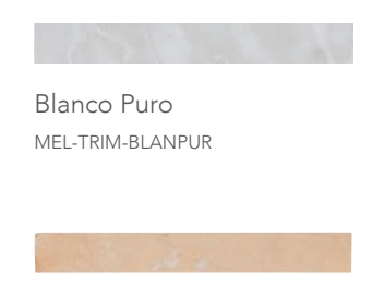
Blonde Cotto MEL-TRIM-BLONCOT