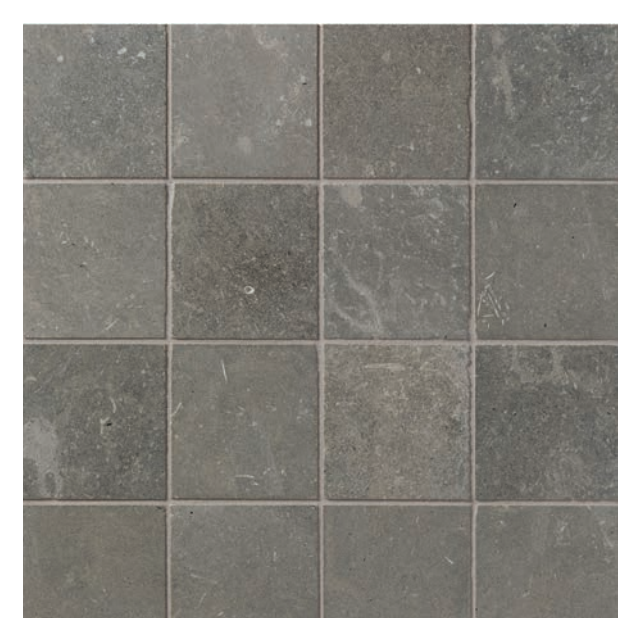
Gris Limestone MEL-4X4FLD-GRIS