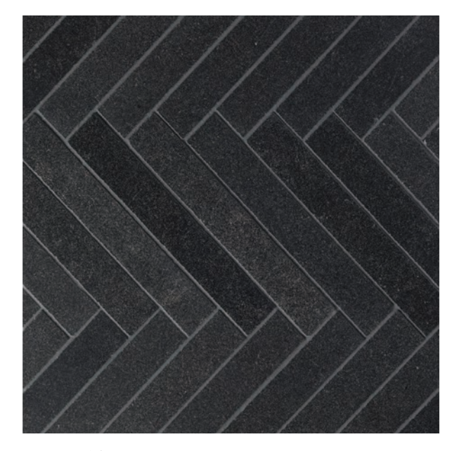
Noir Marble MEL-HERRING-NOIR