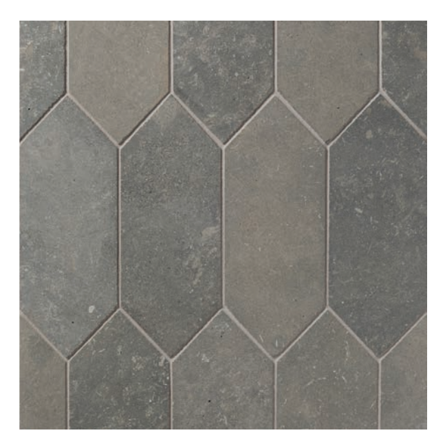
Gris Limestone MEL-PICKT-GRIS