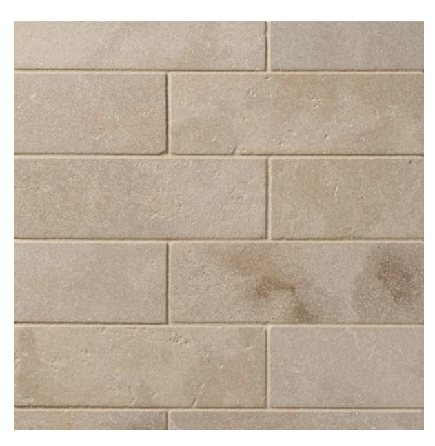
Luberon Limestone MEL-3X10-LUBERON