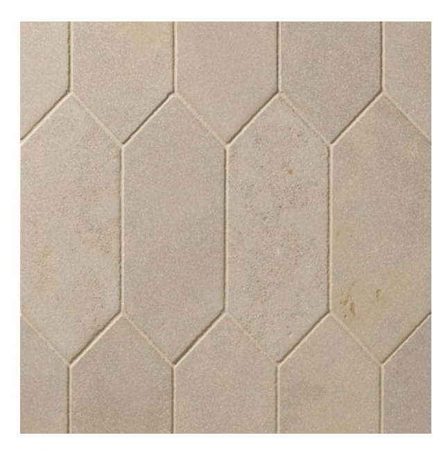
Luberon Limestone MEL-PICKT-LUBERON