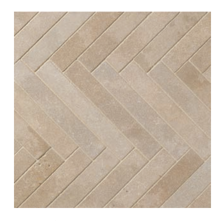
Herringbone 1 ½" X 10" Luberon Limestone

All sizes noted are nominal. *Mosaics are mesh mounted.