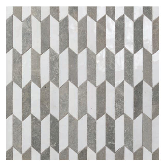
Blanc Gris MEL-SEVILLA-BLANCGR