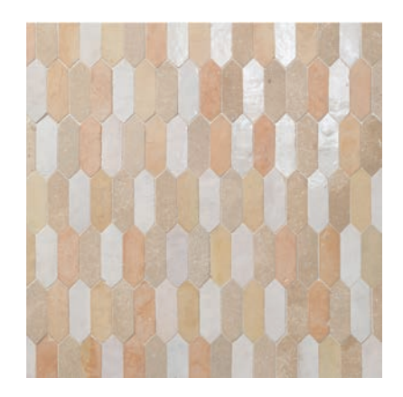
Carthage Mosaic 1" x 3" Latte