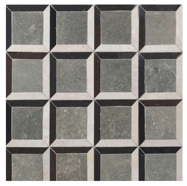
Blanc Gris MEL-OSTIA-BLANCGR