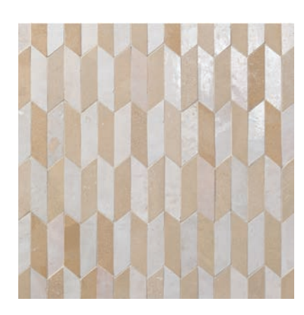
Sevilla Mosaic 1" x 4" Latte