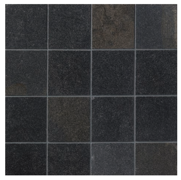
Noir Marble MEL-4X4FLD-NOIR