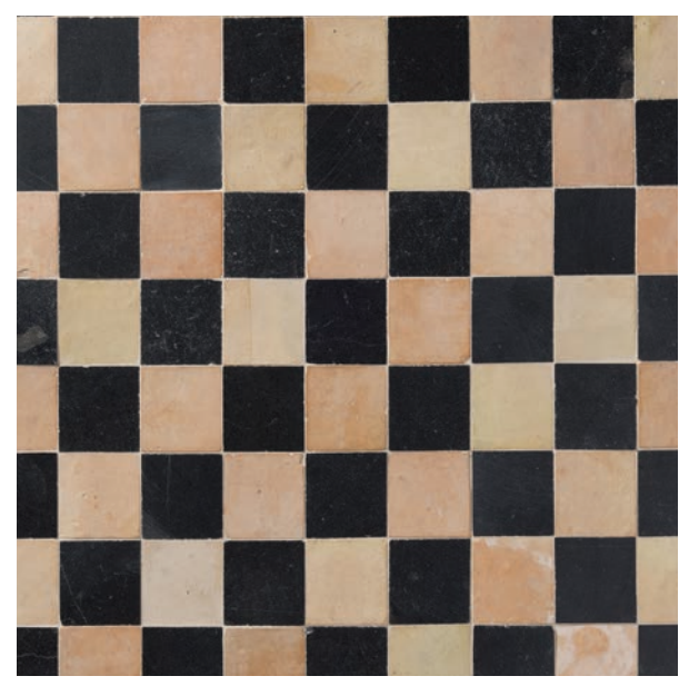
Jaune Noir MEL-PROVENC-JAUNENO