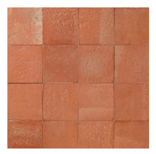
Rouge Cotto MEL-4X4FLD-ROUGCOT