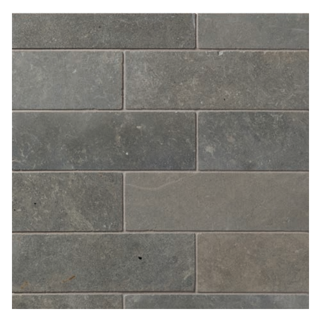
Gris Limestone MEL-3X10-GRIS