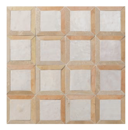
Ostia Mosaic 1" x 4", 2 ¾" x 2 ¾" Latte