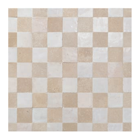
Provence Mosaic 2" x 2" Latte