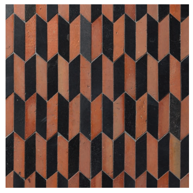
Noir Rouge MEL-SEVILLA-NOIRROU