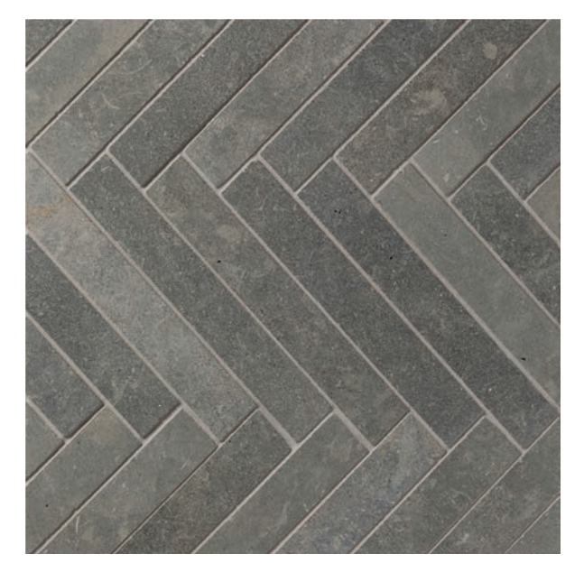
Gris Limestone MEL-HERRING-GRIS

All sizes noted are nominal. *Mosaics are mesh mounted.