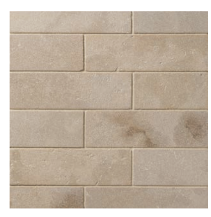
3" x 10" Field Luberon Limestone