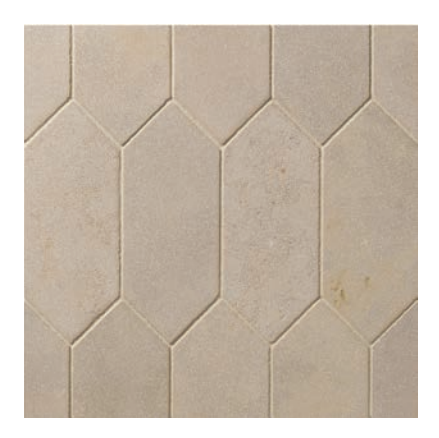
Picket 4" x 10" Luberon Limestone