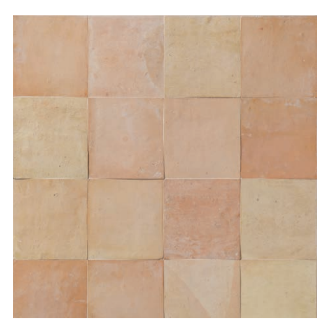
Blonde Cotto MEL-4X4FLD-BLONCOT