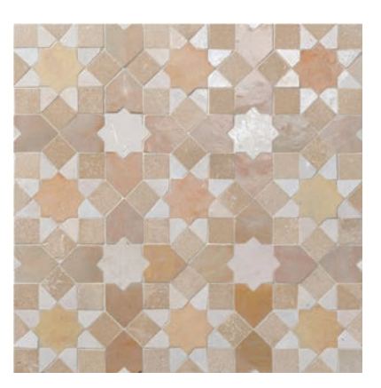
Tangier Mosaic - 12" x 12" Sheet Latte