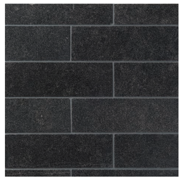
Noir Marble MEL-3X10-NOIR