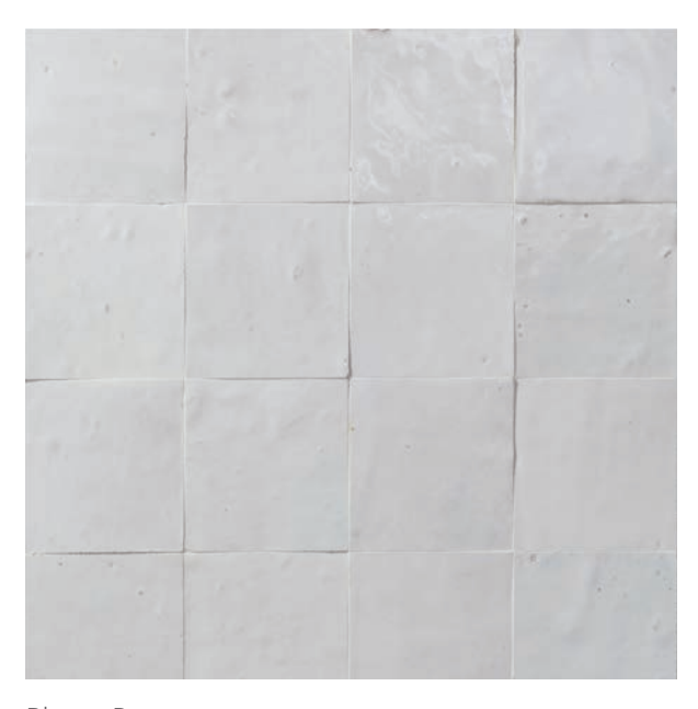
Blanco Puro MEL-4X4FLD-BLANPUR