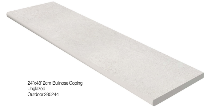
24"x48" 2cm Bullnose Coping Unglazed Outdoor 285244