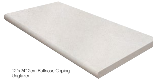
12"x24" 2cm Bullnose Coping Unglazed Outdoor 285241