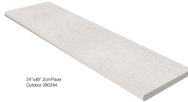
24"x48" 2cm Paver Outdoor 280244