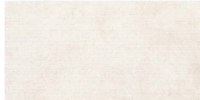
24"x48" Field Tile Rigato 270397