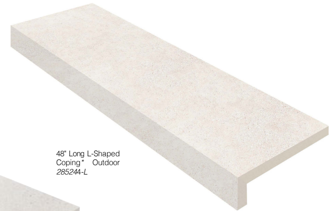
48" Long L-Shaped Coping* Outdoor 285244-L