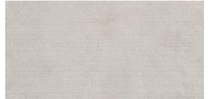
24"x48" Field Tile Rigato 270398