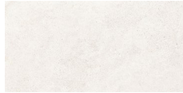
24"x48" Field Tile Natural 270395