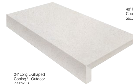
24" Long L-Shaped Coping* Outdoor 285241-L