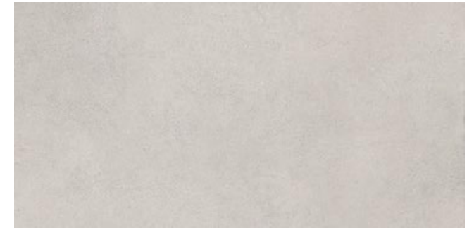
24"x48" Field Tile Natural 270396