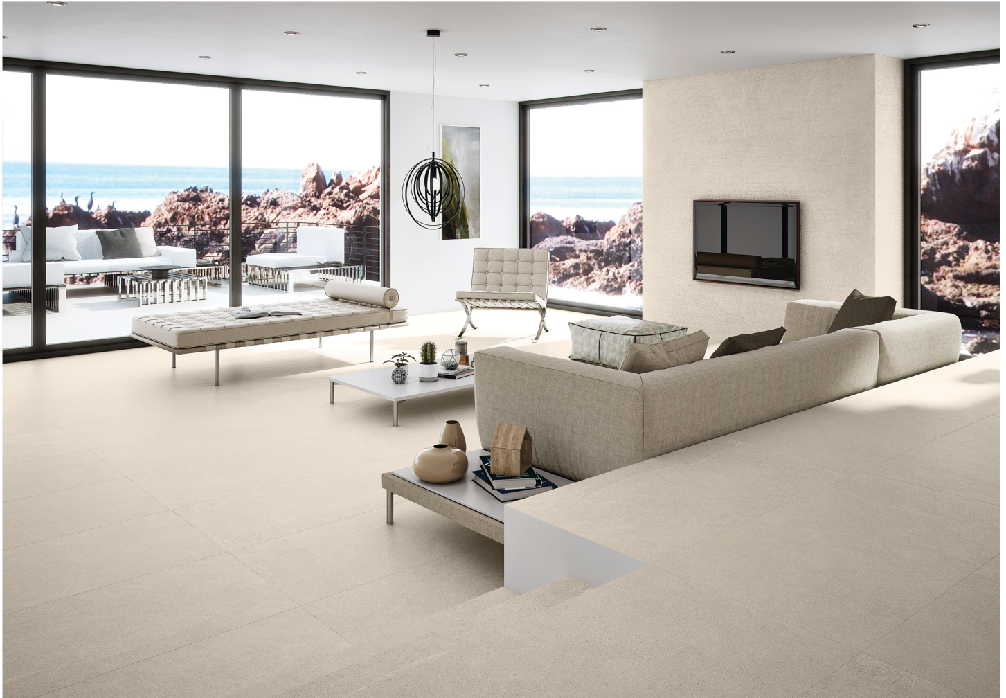
DUNE NATURAL 24"X48"