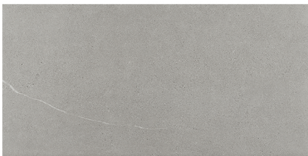
CLIFF NATURAL 24"X48" CLIFF NATURAL 30"X30"