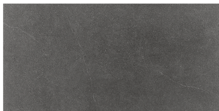
DRIFT NATURAL 24"X48" DRIFT NATURAL 30"X30"