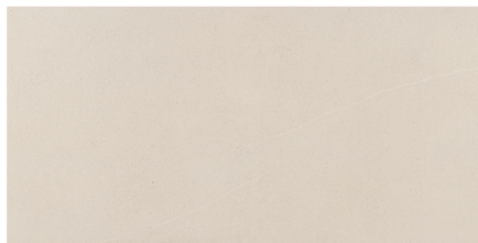
DUNE NATURAL 24"X48" DUNE NATURAL 30"X30"