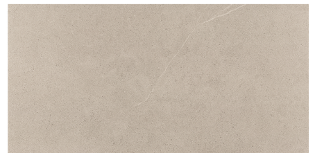
SHORE NATURAL 24"X48" SHORE NATURAL 30"X30"