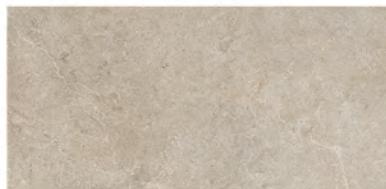
RIFT NATURAL 24"X48"