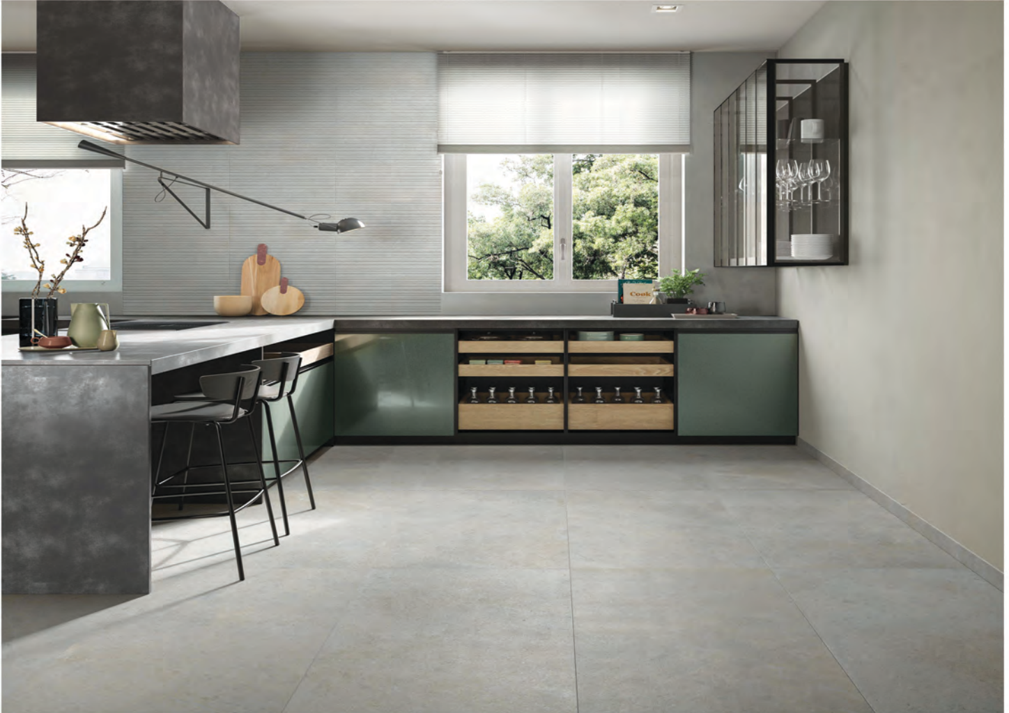
BONE NATURAL 24"X48"