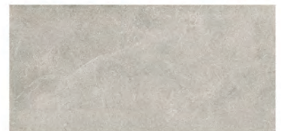
PERLA NATURAL 24"X48"