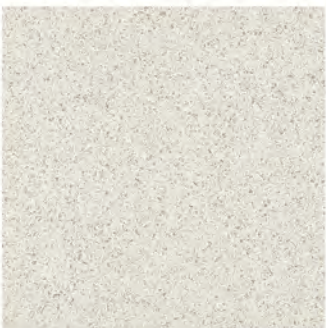
WISP NATURAL 24\"/>