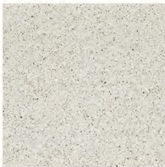
SILK NATURAL 24\"/>