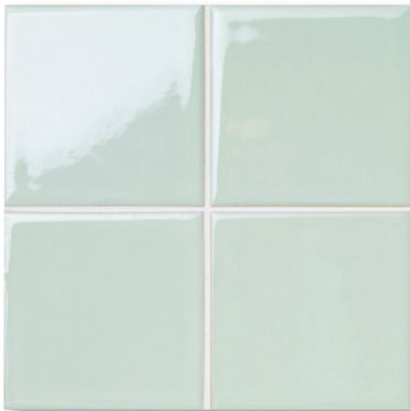
DM-43 Sea Glass