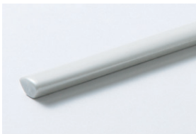
Jolly Piece 9/16" x 6"