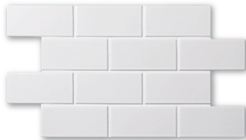
CON-2F Matte White