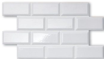
CON-1B Glossy White