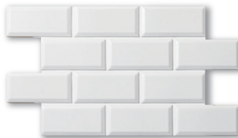
CON-2B Matte White